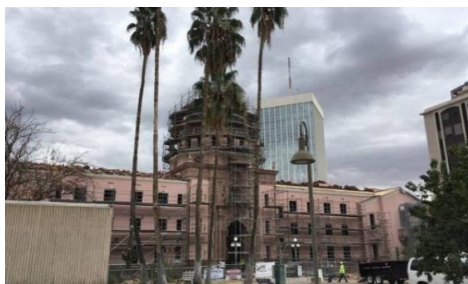
Pima County Courthouse

The 44 low-income housing project on Stone Avenue across from the Police station will be completed by the end of February. Portions of the original historic property remain and will be used for the office and lobby areas. A new 4-story addition has been constructed at the rear of the property to allow for covered parking on the ground floor.