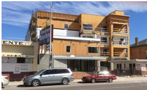
Downtown Motor Apartments

"Luxury Urban Living." Construction is nearing completion on the 25 new multi-story, market-rate apartment complex across from St. Augustine Cathedral on Stone Avenue. Different floor plans are available and all units come with a garage. The project is expected to be completed in spring 2017.